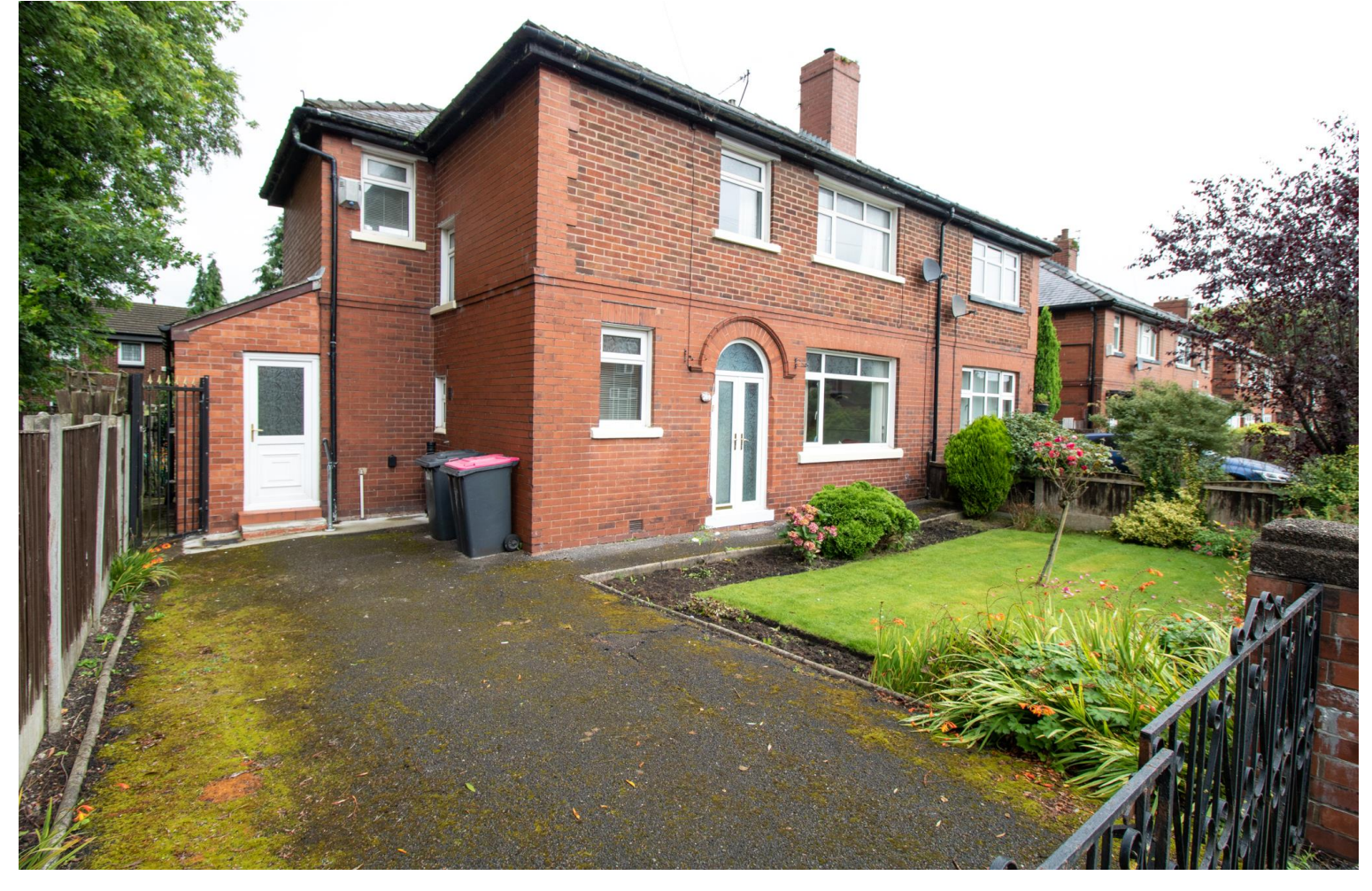
Cleggs Lane, Little Hulton, Manchester, M38 9NJ